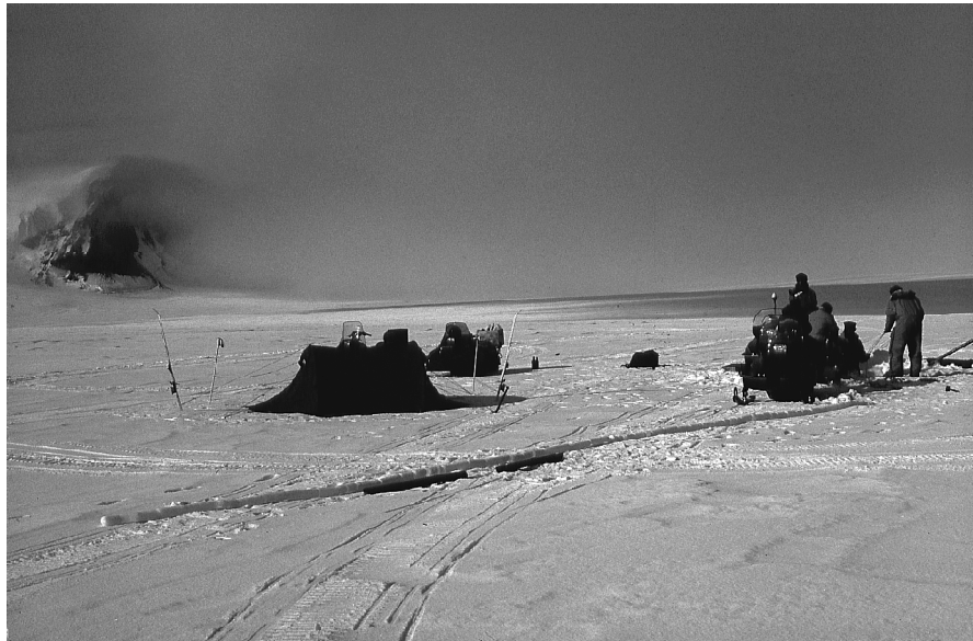
Figure 2. The core extracted on 31. August, 1994. Hvannadalshnúkur is in the background. – Kjarninn sem tekinn var 31. ágúst, 1994. Hvannadalshnúkur í baksýn.

P K : Precipitation at Kvísker between September 1st in previous year and measurement date.